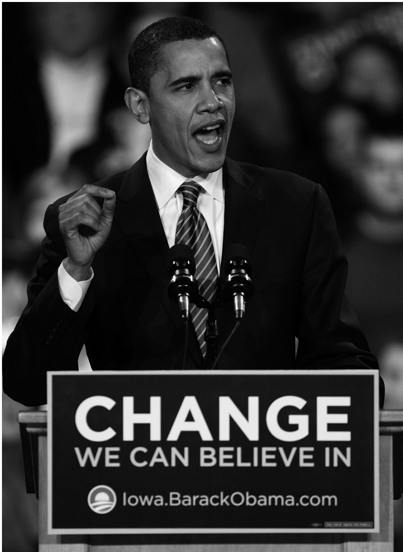
“Obama is an idealist”

are the backbone of this country. Obama has a background, the typical rags to riches story, so therefore he has more of an understanding than McCain.